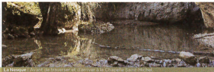
La Nesque | Avant de traverser et d'arriver à la Chapelle Saint-Michel